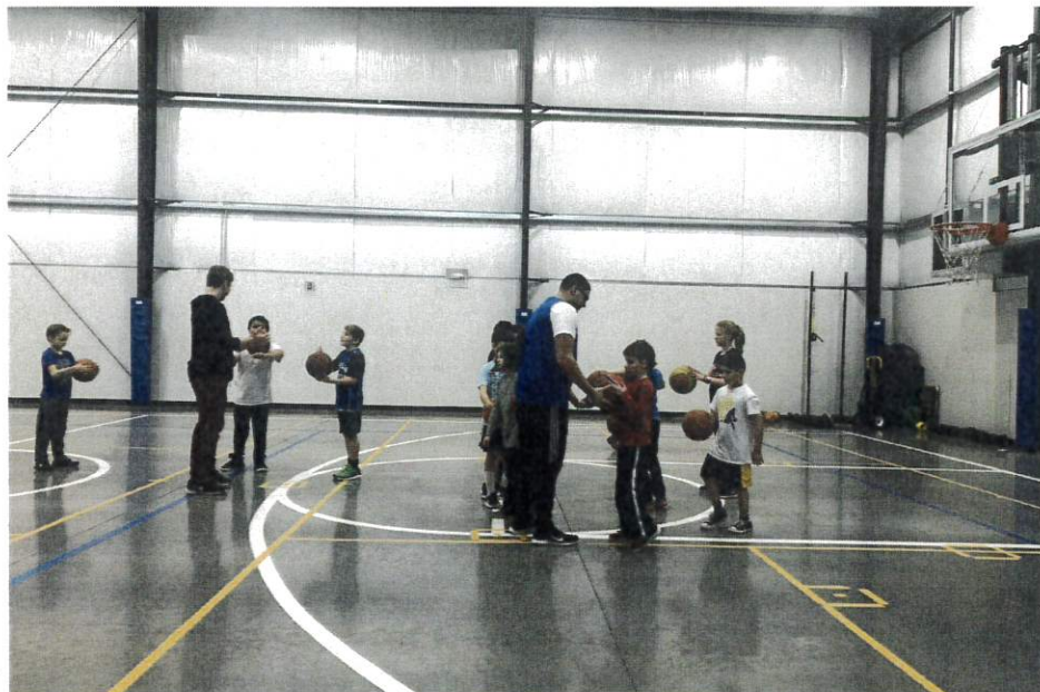
JIM BRINSON ACTIVITY CENTER - Gymnasium Space