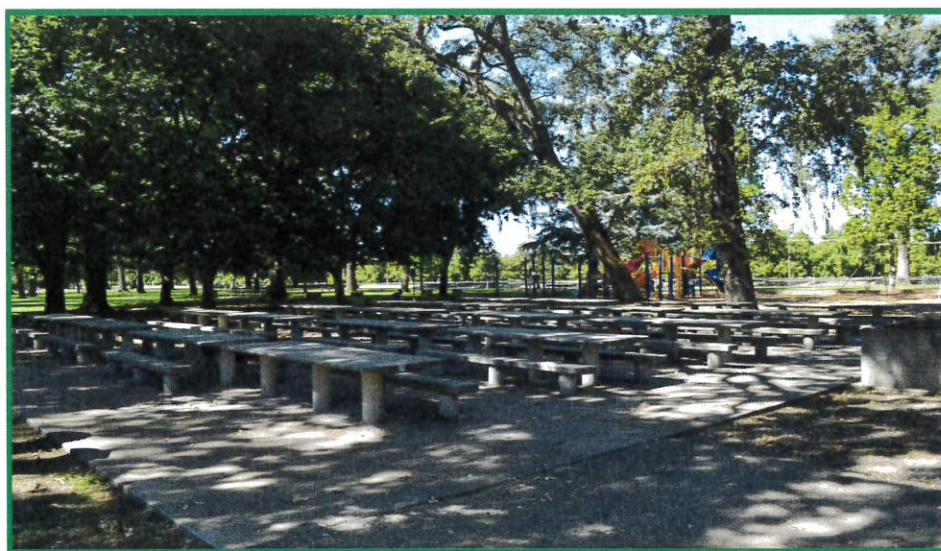
COMMUNITY PARK-Uncovered Group Picnic Site (CP-3)