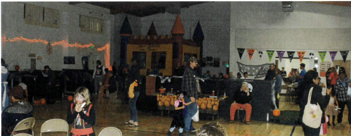
DURHAM VETERAN'S MEMORIAL HALL

Durham Veterans Memorial Hall: The Veterans Memorial Hall was built in 1957, and is host to the Durham American Legion Post No. 673 and the Durham American Legion Auxiliary, for meetings and functions. The District assumed operations of the Hall in 1992. The District currently maintains and uses the Hall for District sponsored special events, programs, and meetings. The Memorial Hall consists of a kitchen, large meeting room, Legion meeting room, main floor, and stage area, and is available for use by the public.