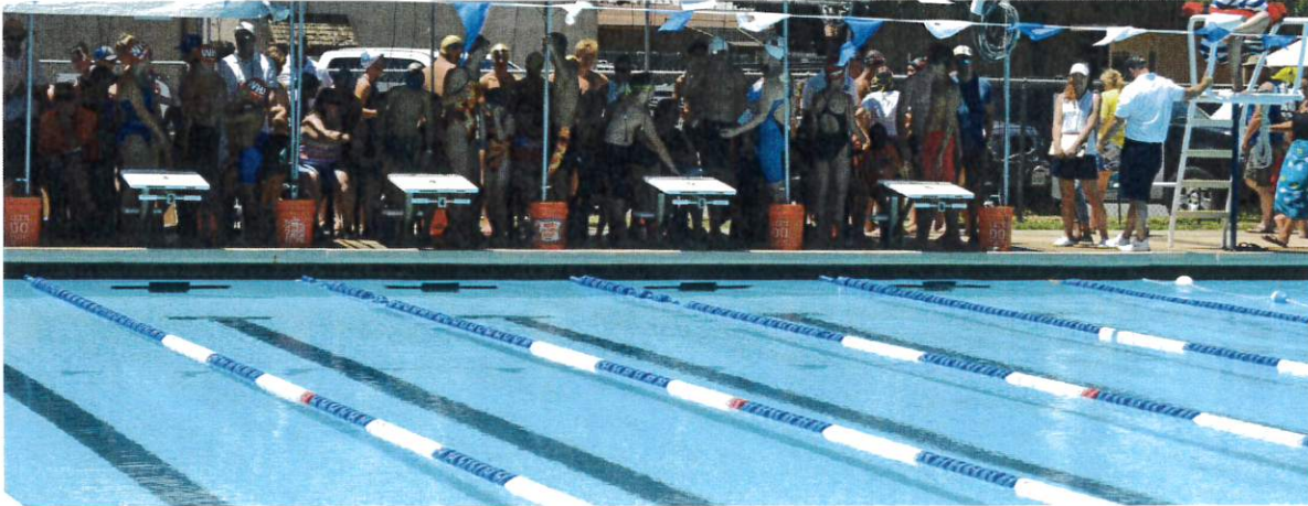
DWIGHT BRINSON SWIM CENTER

Dwight Brinson Swim Center. In March of 1975, DRPD Board of Directors approved purchase of land from the Durham Unified School District for the purpose of building a community pool. The pool was built, at a cost to the District, of approximately $310,000 and was officially opened to the public in June of 1976. Since that opening day 44 years ago, The Dwight Brinson Swim Center has been the home to a long list of District sponsored aquatics programs, as well as the Durham Dolphins and Durham High School Swim Teams.